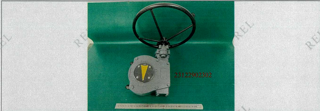
Fig. 1. The representative appearance photo of the sample before the test