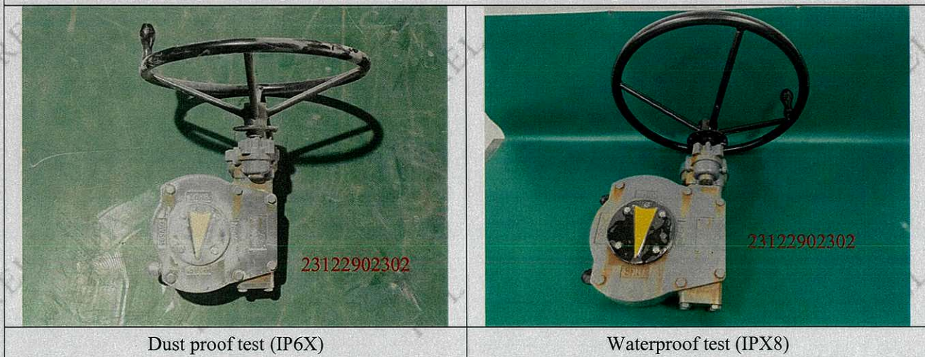
Fig. 3. The representative appearance photos of the sample after the test