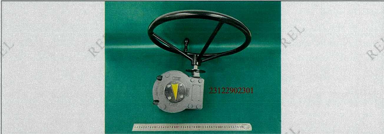
Fig.1. The representative appearance photo of the sample before the test