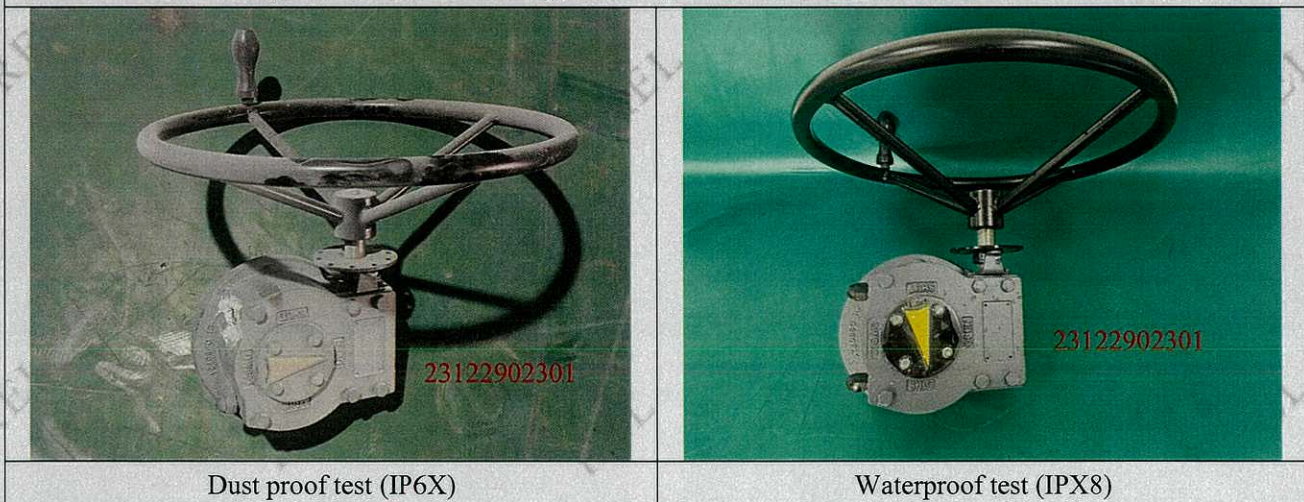
Dust proof test (IP6X)